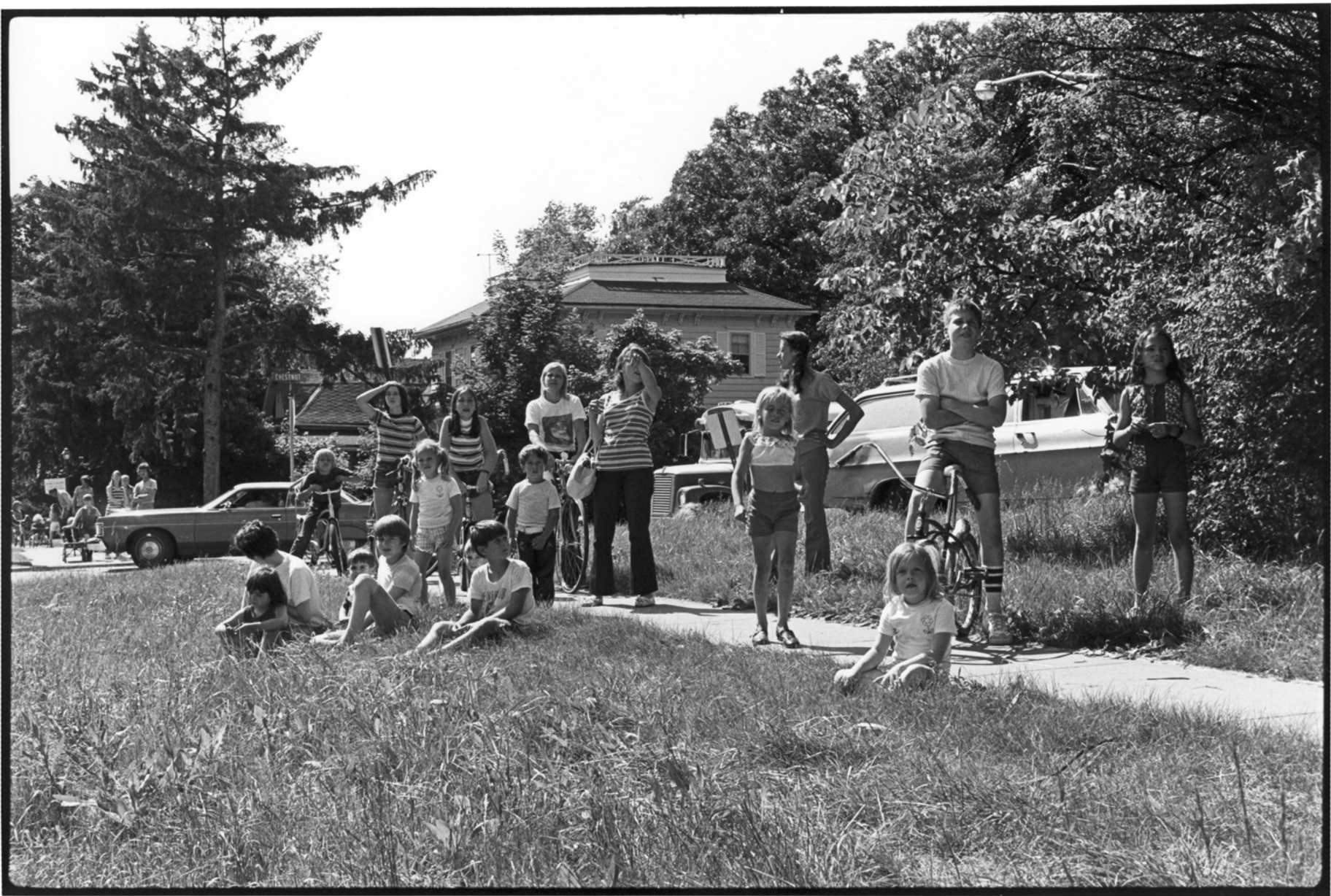
Watching a House Fire, Deerfield, 1975