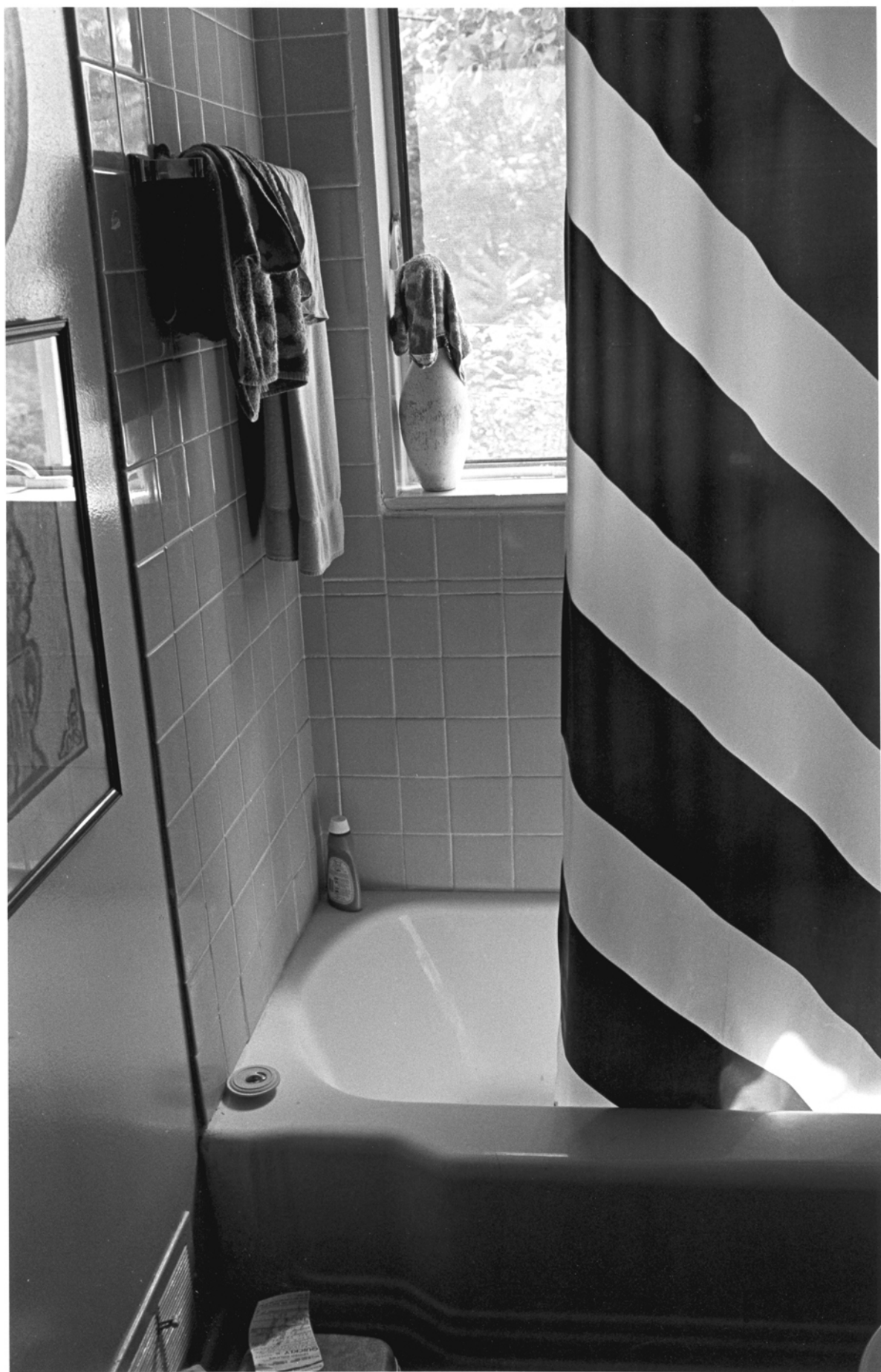
Deerfield Garden Apartments Deerfield Road west of Waukegan Road