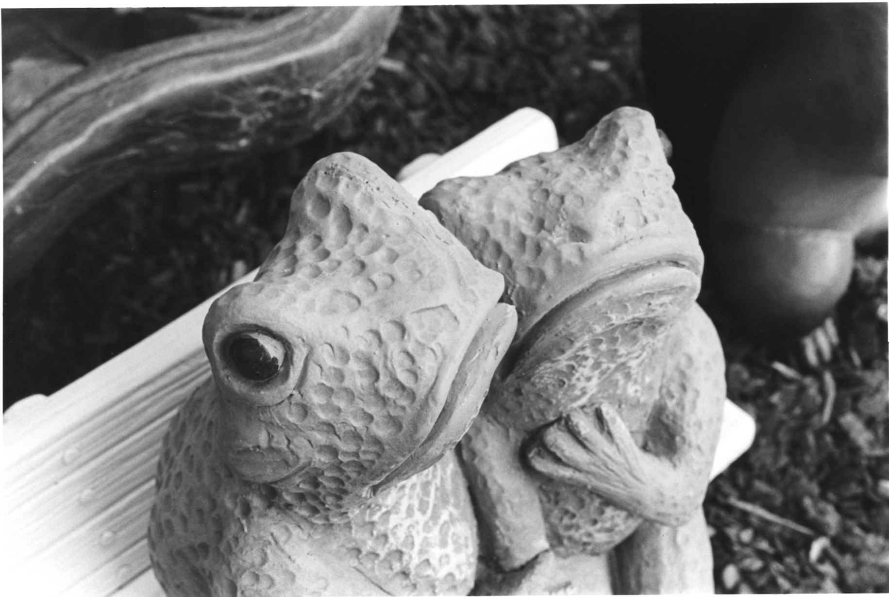
Garden center, Glenview May, 1975