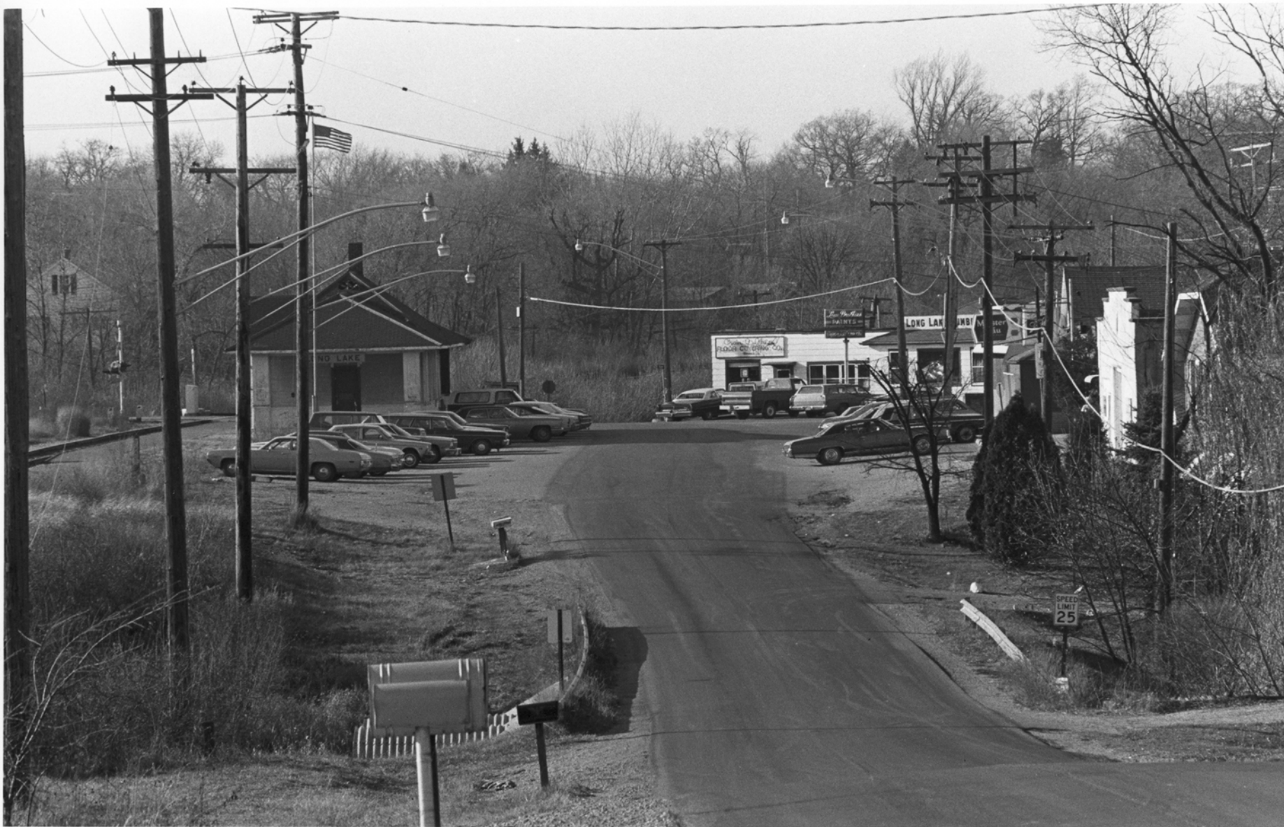
Long Lake November 3, 1975