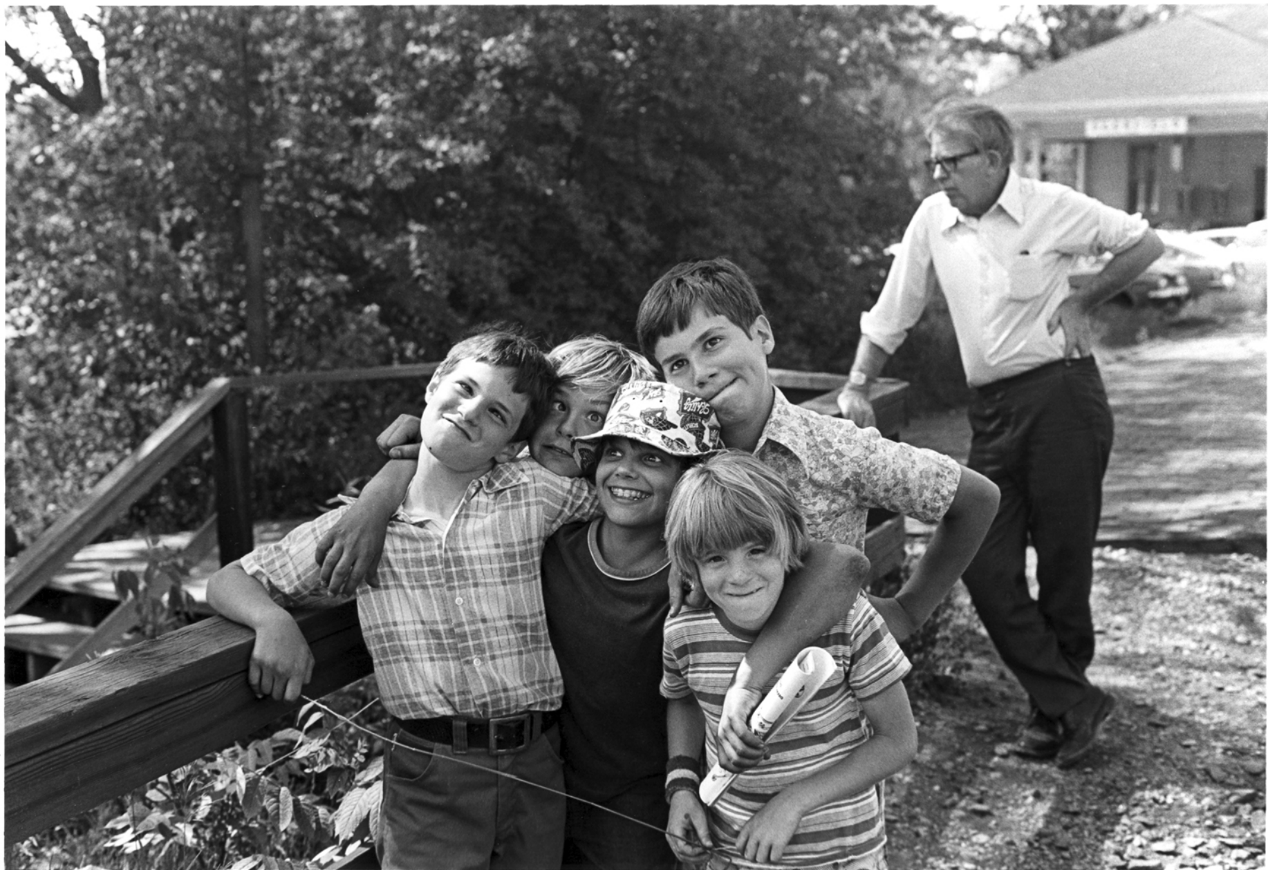
Milwaukee Road Train Station Deerfield, June 13, 1975