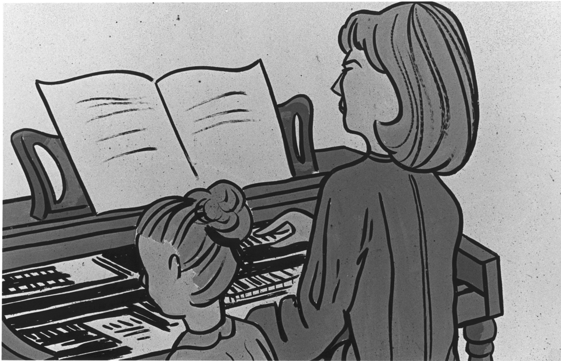
Music store sign Near Lake Zurich, September, 1975