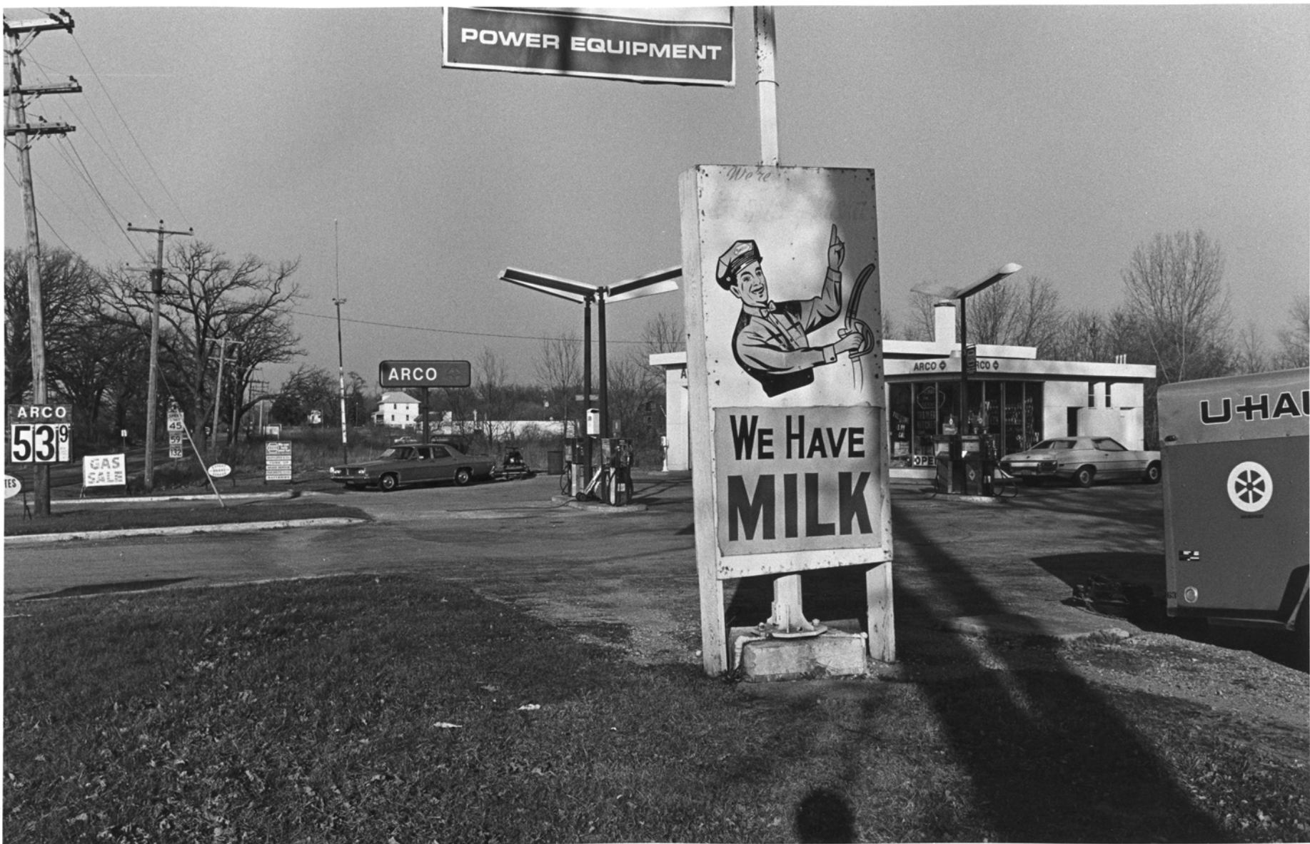
Gas station, East of Fox Lake December 4, 1975