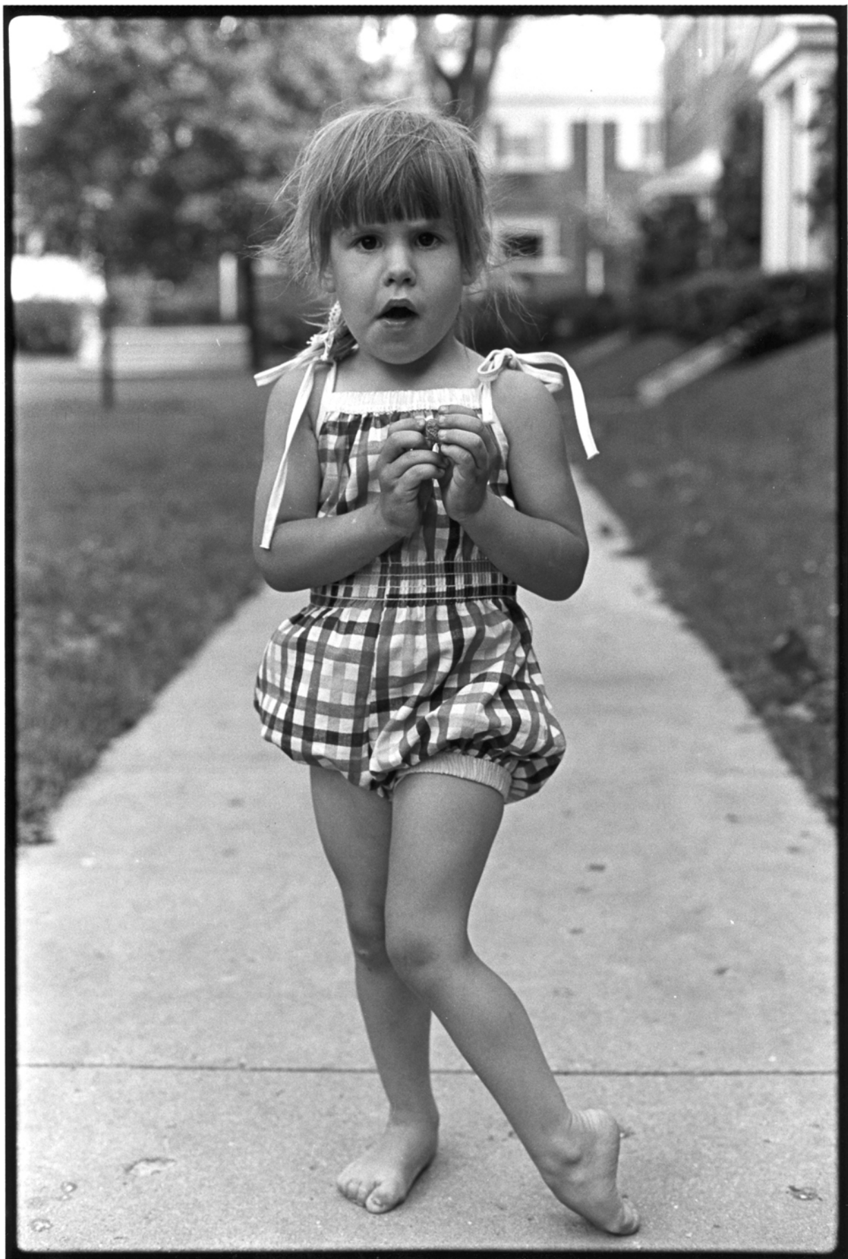
Deerfield Garden Apartments Deerfield, June, 1975