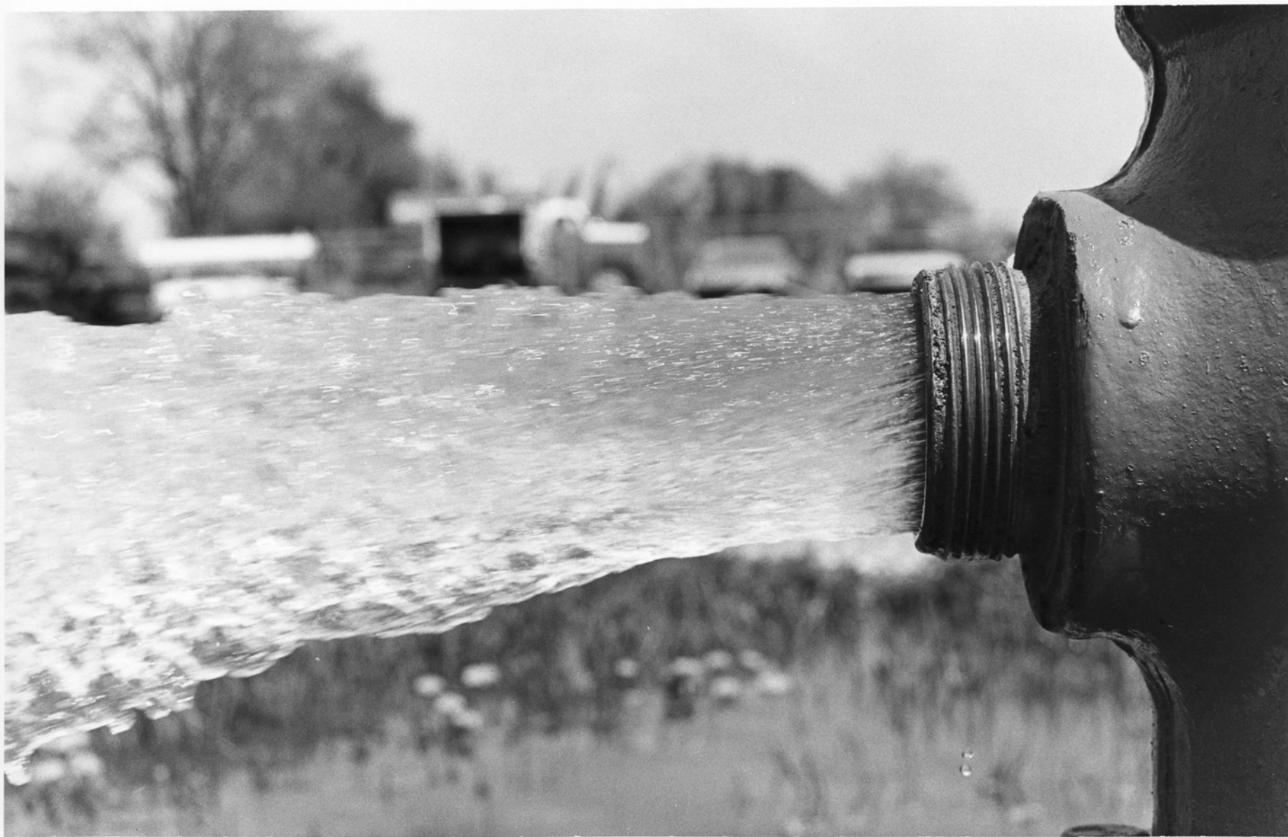
Wheeling, May, 1975