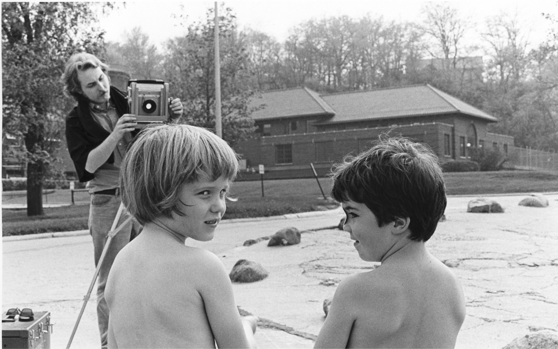
Wilmette beach May, 1975