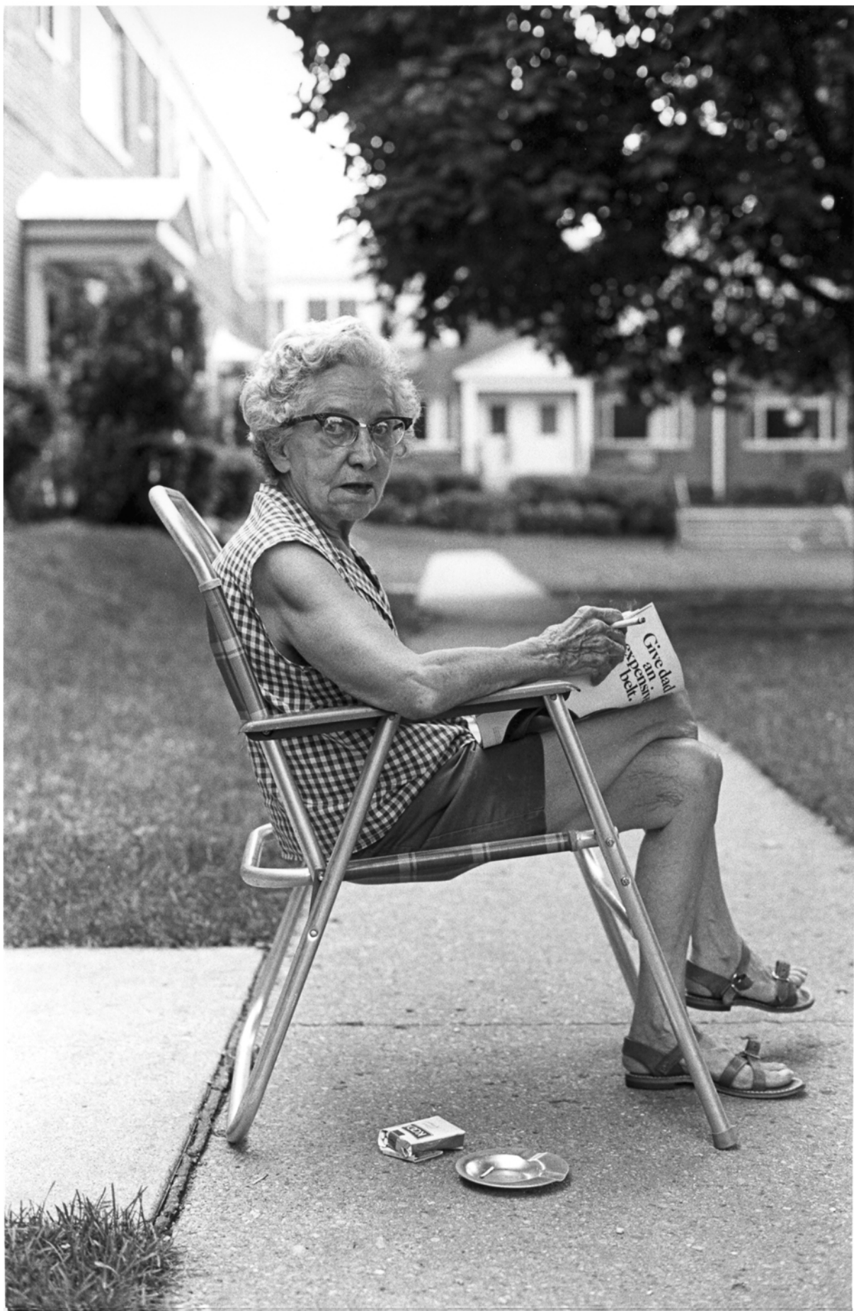
Deerfield Garden Apartments Deerfield, June, 1975